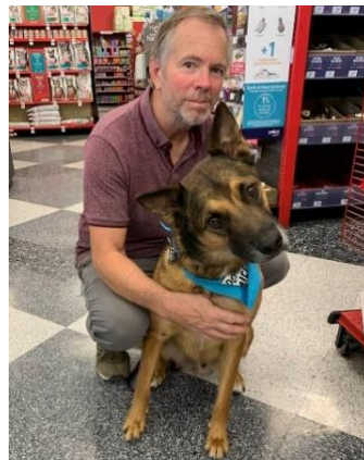
Volunteer Dog Fosterer

Volunteer providing leash training to one of our sheltered dogs.