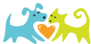
PALM SPRINGS ANIMAL SHELTER

For owned cats and dogs, we work to underwrite spay and neuter mobile clinics serving the eastern portion of the valley through a partnership with Coachella Animal Network (CAN).