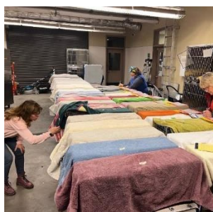
Community cats awaiting spaying and neutering at the Palm Springs Animal Shelter.

Thank You Traveling Paws for coordinating the pickup, delivery, and returning the many cats to and from these clinics.