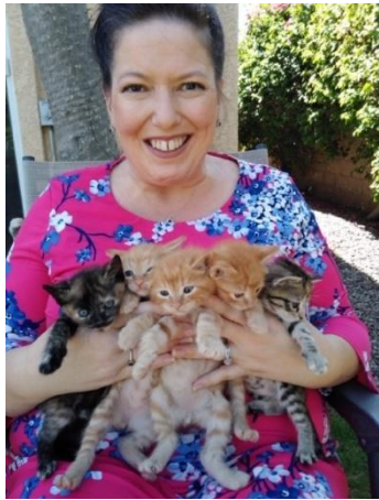
Volunteer Kitten Bottle Feeder

We are honored to report that 122 volunteers provided 6,976 hours of service in 2022.