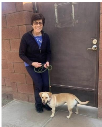
Volunteer Behavior Training

Volunteer providing maintenance and care services.