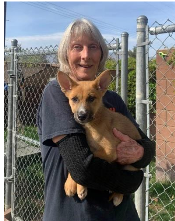
Volunteer Animal Care Services

Opening her home to care for the most vulnerable, newborn kittens.